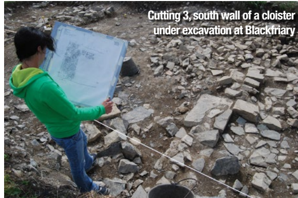
Cutting 3, south wall of a cloister under excavation at Blackfriary

archaeologists conduct their research, how inferences are drawn from the uncovered clues, and how the data are used to interpret the past. Follow an Interactive Dig to connect with the archaeologists, comment on and discuss their projects, peruse images and video clips of ongoing excavations, and interpret finds as they are uncovered.