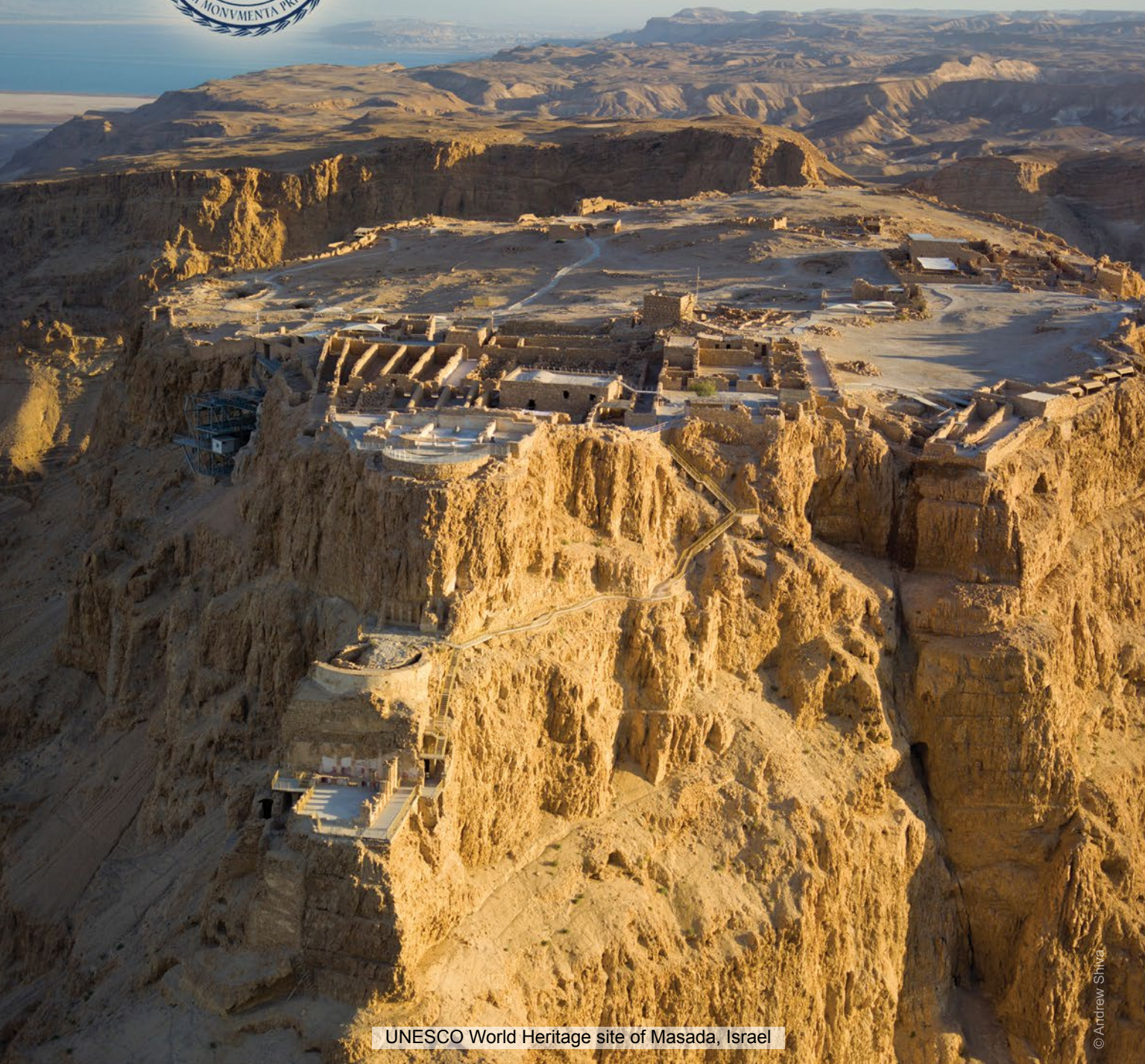
UNESCO World Heritage site of Masada, Israel