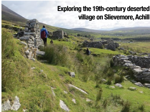
Exploring the 19th-century deserted village on Slievemore, Achill

are excavating the only known mountaintop Minoan settlement. Located on a plateau on Mt. Ida, Zominthos lies on the ancient route between the famous palace at Knossos and the sacred Ideon Cave, where many believe the god Zeus was