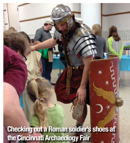
Checking out a Roman soldier's shoes at the Cincinnati Archaeology Fair