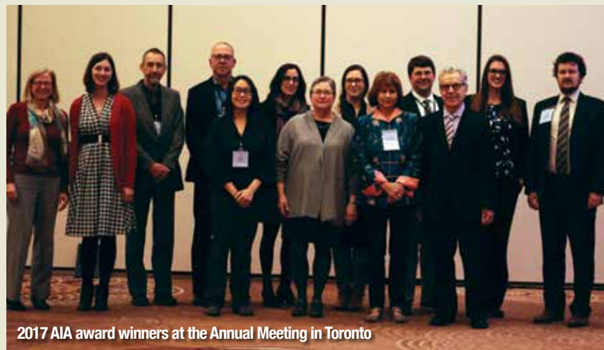
2017 AIA award winners at the Annual Meeting in Toronto