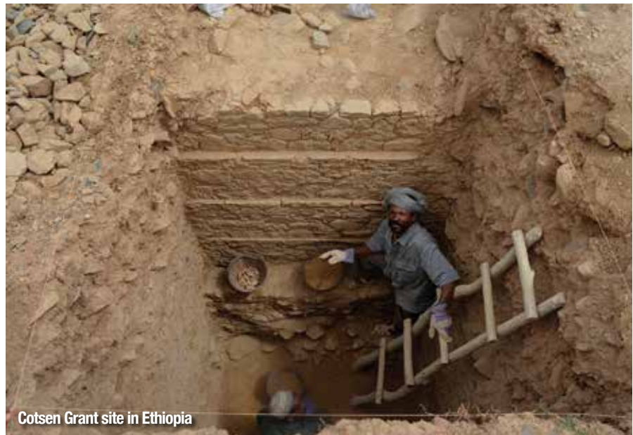
Cotsen Grant site in Ethiopia