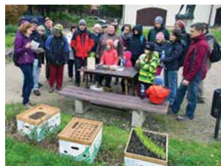
IAD event at the Museum of Central Bohemia, Rostoky, Czech Republic

I NTERNATIONAL ARCHAEOLOGY Day (IAD), the yearly global celebration of archaeology coordinated by the AIA, continues its unprecedented growth. In 2016 more than 700 events (about 200 more than in 2015) were held in 24 countries. The events were organized and hosted by about 530