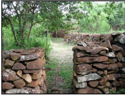
Gate and wall complex at Thimlich Ohinga.