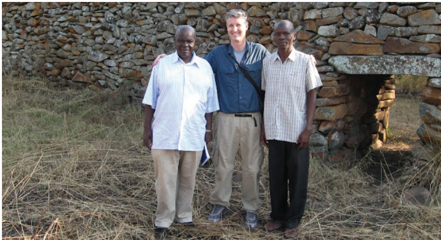
The global community also cares about this heritage site. American museum professionals are helping us tell Thimlich Ohinga's story.

Residents of the South Nyanza province will be on the front lines of Thimlich Ohinga's conservation, and are excited to teach others of its wonder. Ask the visitor's center how you can share and preserve Thimlich Ohinga's cultural legacy!