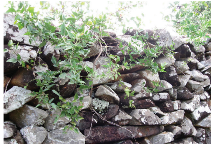
Weeds poke through the stone.