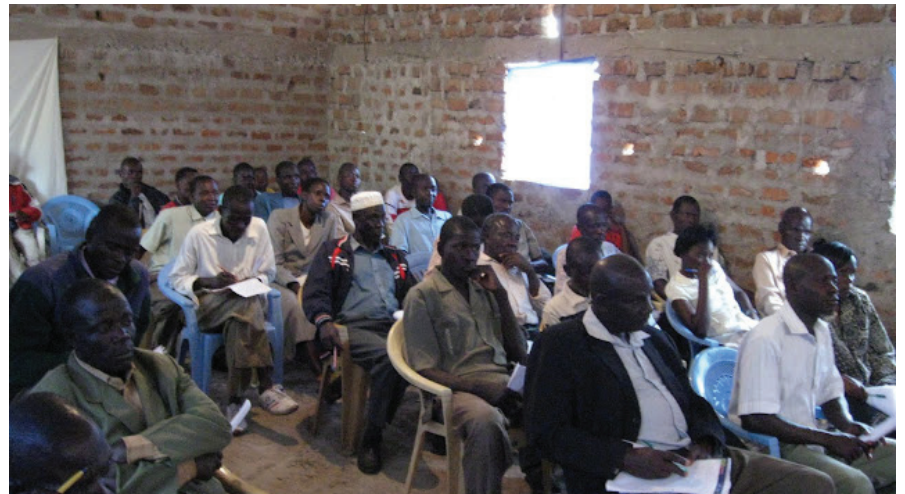
Citizens from across Kenya gather to learn how to keep Thimlich Ohinga's legacy alive.