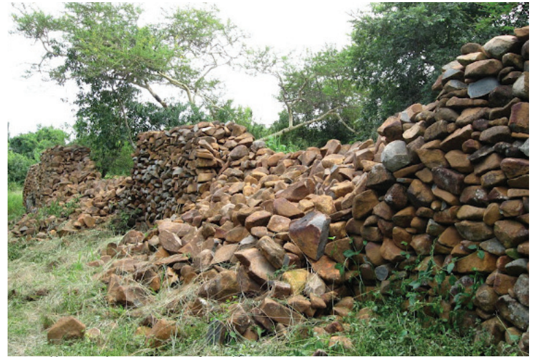
A collapsed section of wall.

As a World Heritage Site, Thimlich Ohinga will receive the care that it deserves, and will become an educational resource for anyone wanting to learn more about the memorial's history and geology.