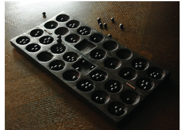
Bao, or Mancala, as it looks today.

The stone is an early version of the popular East-African game Bao, a form of the Mancala board game. It seems that despite the responsibilities of life at Thimlich Ohinga, there was still time for leisure activities!