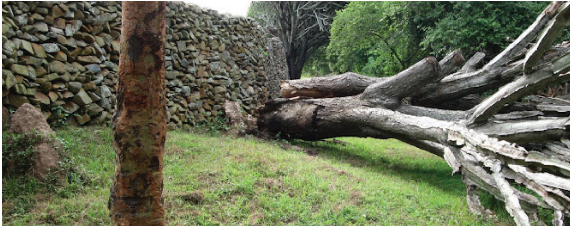
Fallen trees are possible threats to the site.

No, it cannot. Although Thimlich Ohinga has endured many centuries, the years have left a toll. Weather and human contact have caused sections of the wall to crumble, and overgrown grass is popping its head through cracks in the stones. Preservation of this cultural landmark is essential to its continued existence.