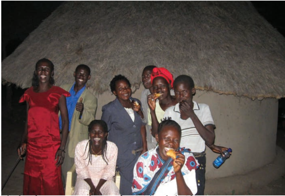
The local community having fun at Thimlich Ohinga.

Thimlich Ohinga was built through hard work, a dedicated and unified community, and the hands of many. These same components are being utilized again to preserve the site for today's global audience and future generations.