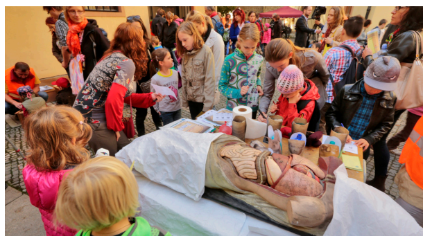
The Czech Institute of Egyptology at Charles University in Prague welcomed 1,000 visitors to its archaeology fair and accompanying lecture and film screening.