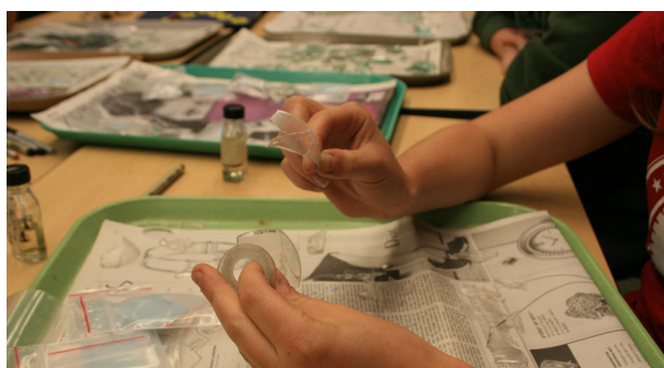
Workers reassemble a bottle uncovered at Johnson's Island. Reconstructing objects helps archaeologists understand their manufacture and function.

Photos from the contest are featured in the AIA calendar "A Year of Archaeology." Proceeds from calendar sales support the Site Preservation Program.