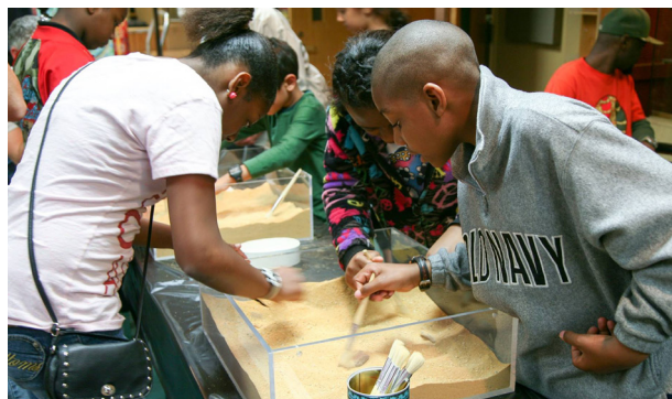
Visitors to the Freer Gallery of Art and Arthur M. Sackler Gallery participate in Archaeological Adventures, a hands-on learning activity for children.

Interactive Digs make archaeological fieldwork accessible to anyone with an Internet connection. Project directors share photos, videos, and articles as the field season progresses, letting viewers see for themselves how archaeologists conduct their research. Viewers learn about excavation and laboratory techniques, understand how inferences are drawn from the uncovered clues, and see how the data are used to interpret the past. The first Interactive Digs were