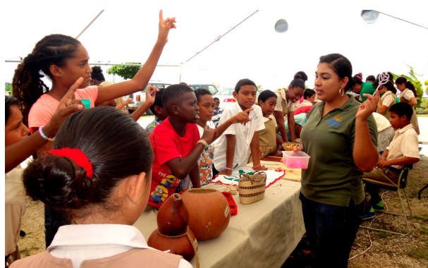
A presenter from the Institute for Social and Cultural Research explains traditional activities still practiced by present-day Maya communities at an International Archaeology Day fair at the Belize Institute of Archaeology.

The Lecture Program, as always, offered opportunities for Societies and the general public to learn about the latest archaeological discoveries. This past year, there were 219 lectures given by 86 lecturers to an average audience size of 92.