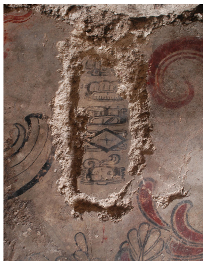
A mural with glyphs at San Bartolo, photo courtesy Heather Hurst.

The Alliance for Heritage Conservation received a grant in support of its conservation and education program focused on the remains of a 17th century church in the community of Tahcabo in northern Yucatan. Occupation at Tahcabo, a small Yucatec-Maya village of around 500 people, can be traced back to approximately 400 BC. The arrival of the Spanish in the 16th century brought Christianity to the region. The remains of the church include a stone façade and a portion of the stone-walled sanctuary. Currently, religious services are held in a chapel attached to the original façade. The grant will be used to implement a community stewardship program, protect Tahcabo's archaeological remains, and promote the historical significance of the site.