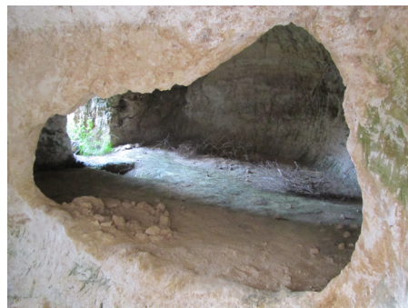
The interior of an Aidonia tomb, photo courtesy Kim Shelton.

The site of Aidonia includes several Late Bronze Age cemeteries dating from the 15th to 13th centuries B.C.E., many of which were looted in the 1970s. The TAPHOS project is designing and implementing a plan to physically secure the site, while increasing awareness about the material destruction and knowledge loss caused by looting. The grant will help fund a visitor's center with exhibit and teaching spaces, the design of materials, staff training, and the establishment of proper pathways and signage throughout the site.