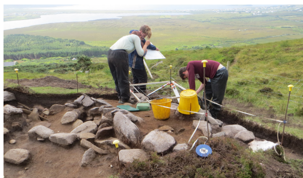
Three workers at the Achill Island Field School examine an enclosure wall.

The AIA received over 250 archaeology-themed photos taken in more than 30 different countries for its fourth annual Photo Contest. More than 11,000 votes were cast in one week in support of the various entries.