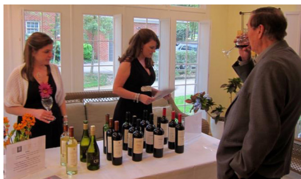
North Alabama Society members sample wines from Chile and Argentina as part of their "New World Wines and Archaeology" lecture and fundraising event.

During the 119th year of the AIA's Lecture Program, 86 top scholars gave 219 free public lectures at 109 AIA Local Societies on recent research and discoveries from around the world. More than 90 people attended each lecture on average, and this number continues to grow each year. Funding for the Lecture Program is provided in part by the Samuel H. Kress Foundation and more than 100 individually endowed lectures.