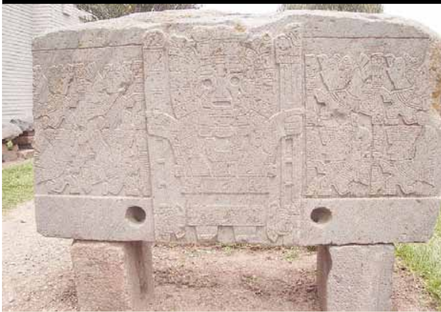
The bilateral agreement between the United States and Bolivia seeks to protect Bolivian artifacts such as this impressive stone carving.

Visit www.archaeological.org/annualmeeting for all the details.