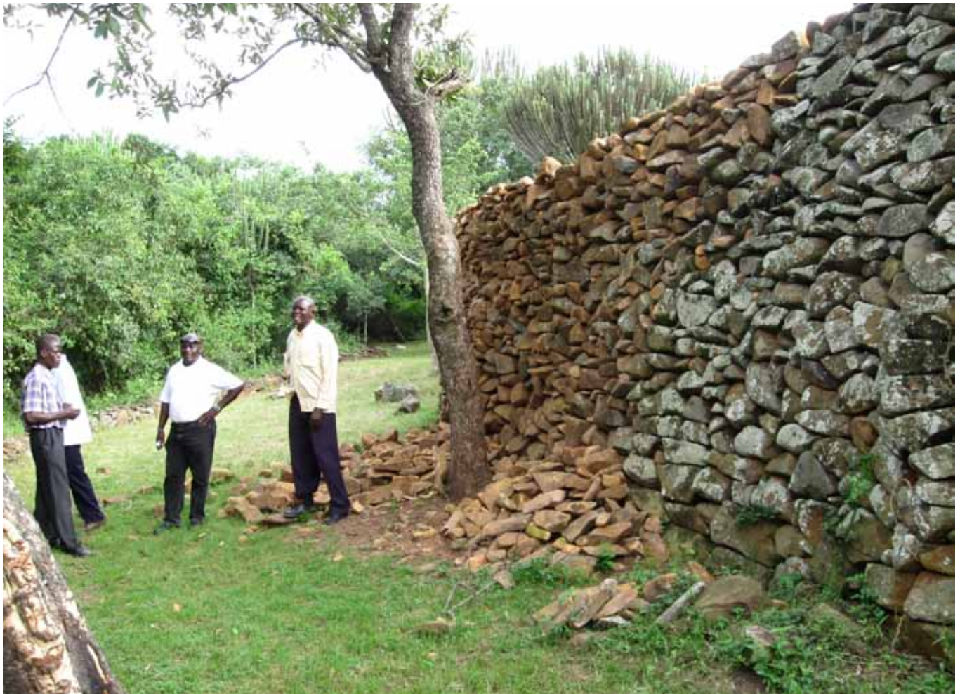
At the site of Thimlich Ohinga in Kenya, prehistoric builders created this wall without the use of mortar.

Initially built and used as a security fortification by a small group of