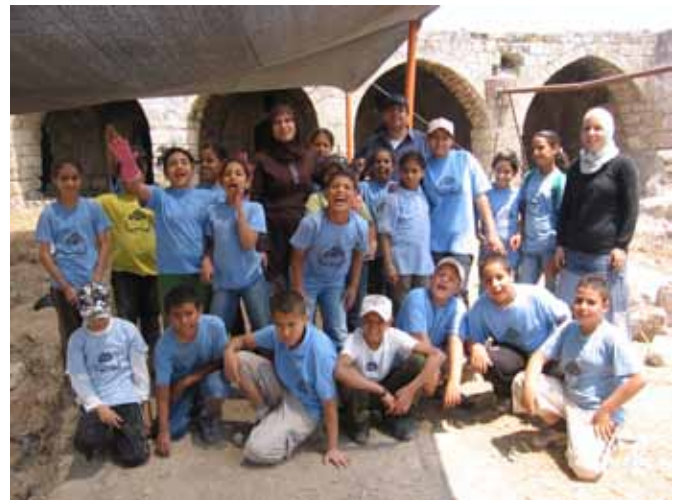
Arab and Jewish children work side by side to excavate Khan el-Hillu, one of ancient Lod's only remaining public buildings.

settlers, the site's functions expanded over time. As population in the area increased, Thimlich Ohinga was used for various social, economic, and political purposes, and even housed domestic animals for a time. According to