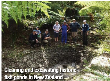
Cleaning and excavating historic fish ponds in New Zealand

B Y ALL ACCOUNTS, International Archaeology Day was a resounding success! Each year this unique celebration of archaeology grows larger and more global. As of October 19, 2013, International Archaeology Day had 180 Collaborating Organizations and more than 375 events planned in 17 countries and 46 U.S. states. We are currently collecting reports from program organizers, and, as of this writing, more than 31,000 people have participated in 118 events around the world. Once all the reports are received and numbers tallied, we predict that participation in International Archaeology Day 2013 will easily surpass the 60,000 that we had last year. We are very excited by the tremendous growth of the program, especially