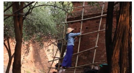
Monuments—Burmese Woman Working on Conservation of 13th-Century Buddhist Temple (Old Bagan, Mandalay, Myanmar), by Lisa Briggs

T HE THIRD ANNUAL AIA Online Photo Contest was held in October 2013. Nearly 150 archaeologically-themed photos from almost 20 countries were submitted in the following categories: Monuments, Excavation, Field Life, Fun Finds, Tools of the Trade, and Archaeological Landscapes. During a weeklong voting period, members of the AIA and the general public cast more than 12,000 votes for their