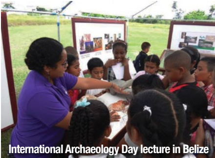
International Archaeology Day lecture in Belize