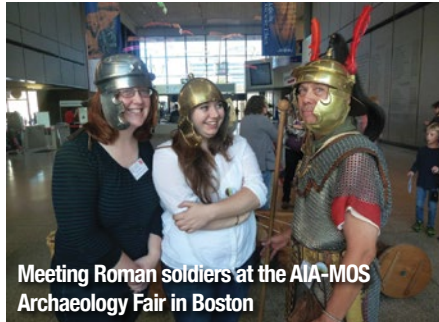
Meeting Roman soldiers at the AIA-MOS Archaeology Fair in Boston