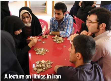
A lecture on lithics in Iran